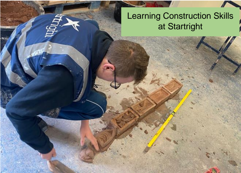
Learning Construction Skills at Starright