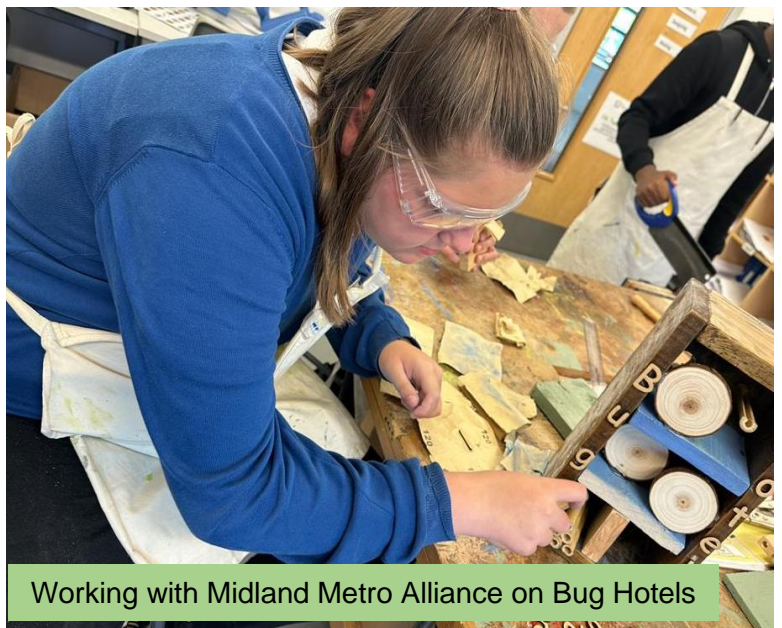
Working with Midland Metro Alliance on Bug Hotels