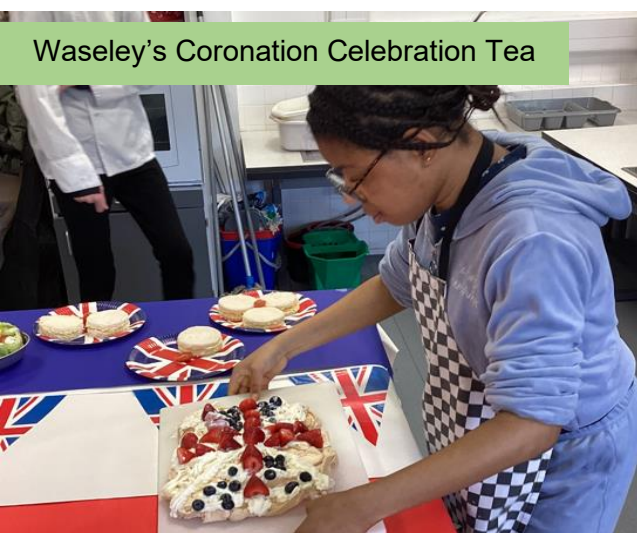
Waseley's Coronation Celebration Tea