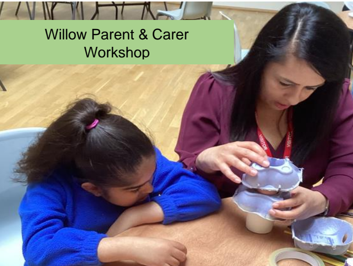
Willow Parent & Carer Workshop