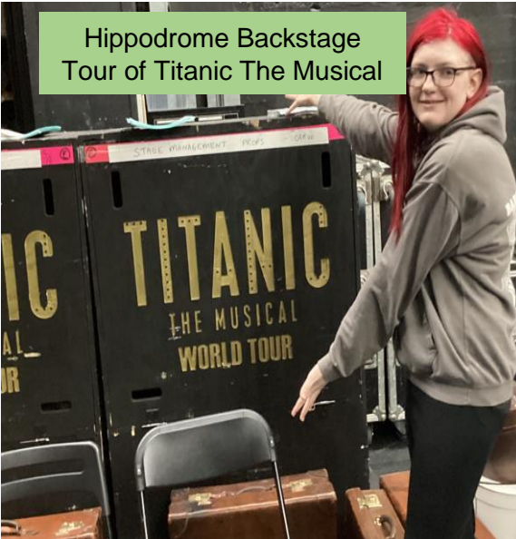
Hippodrome Backstage Tour of Titanic The Musical