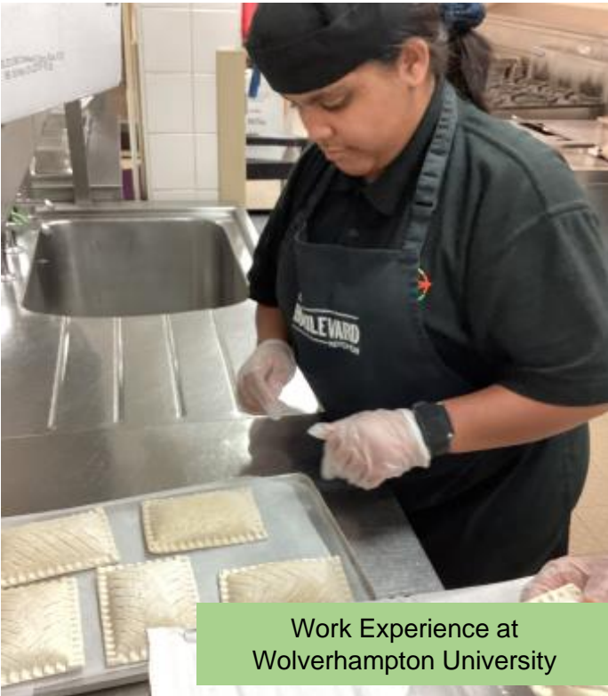
Work Experience at Wolverhampton University