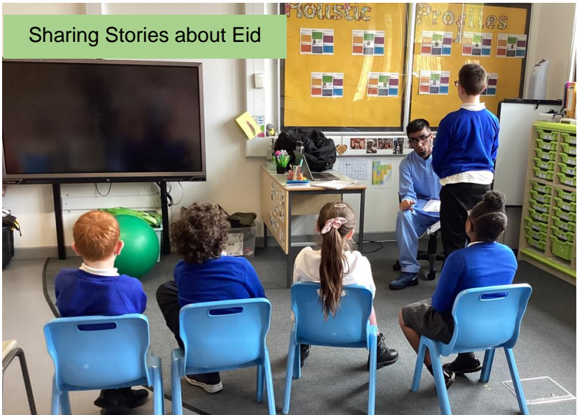
Sharing Stories about Eid