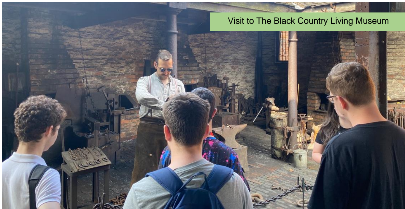
Visit to The Black Country Living Museum