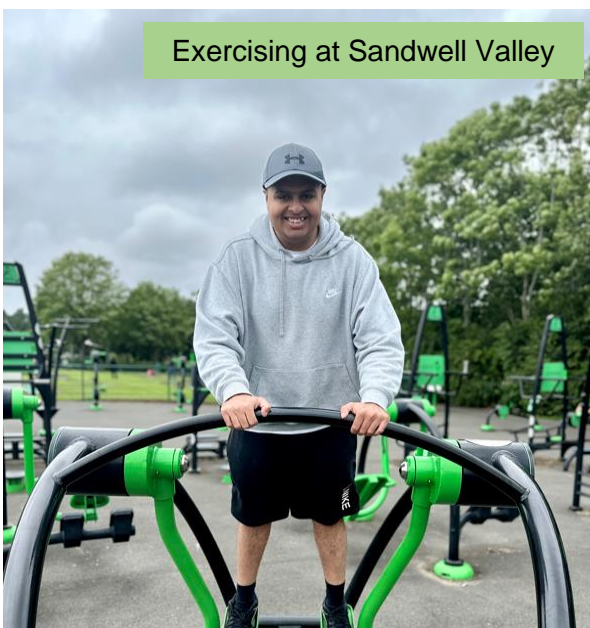
Exercising at Sandwell Valley