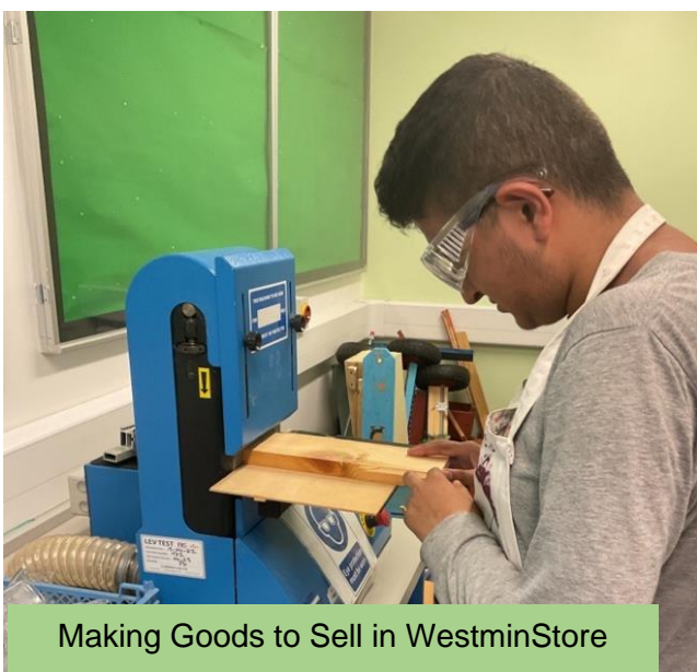
Making Goods to Sell in WestminStore