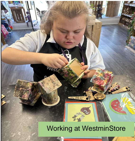
Working at WestminStore