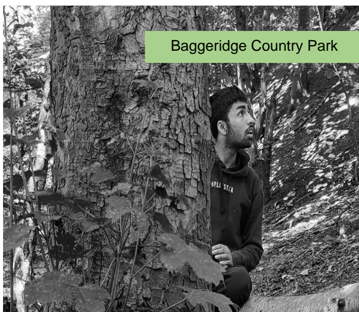
Baggeridge Country Park