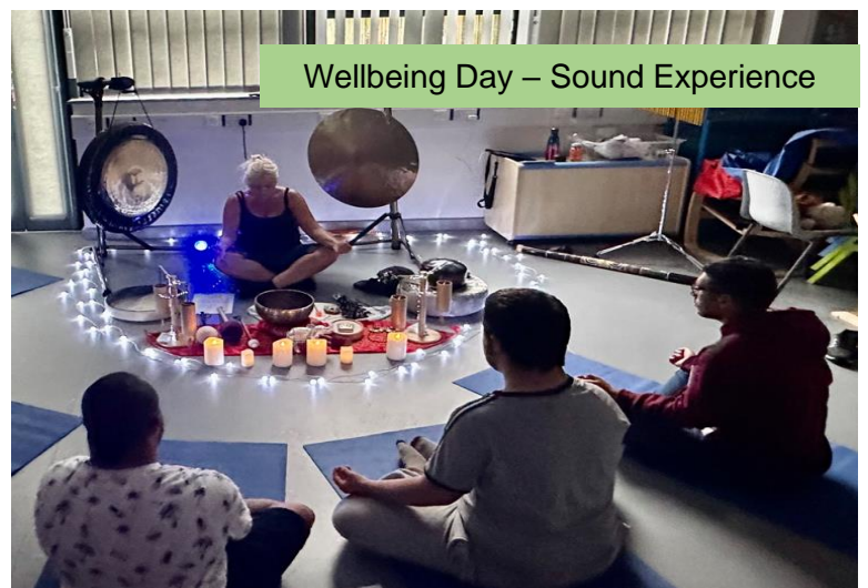
Wellbeing Day – Sound Experience