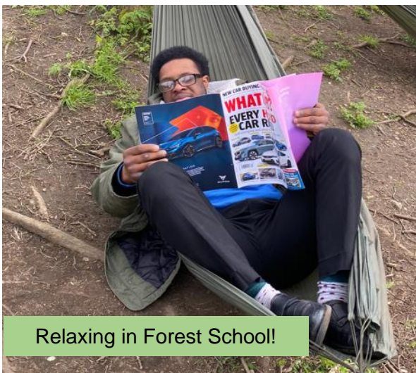
Relaxing in Forest School!