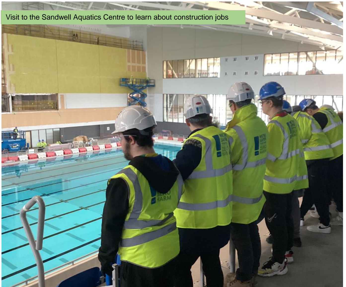
Visit to the Sandwell Aquatics Centre to learn about construction jobs