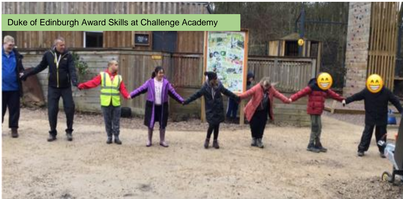
Duke of Edinburgh Award Skills at Challenge Academy