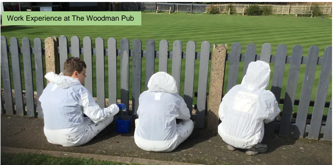
Work Experience at The Woodman Pub