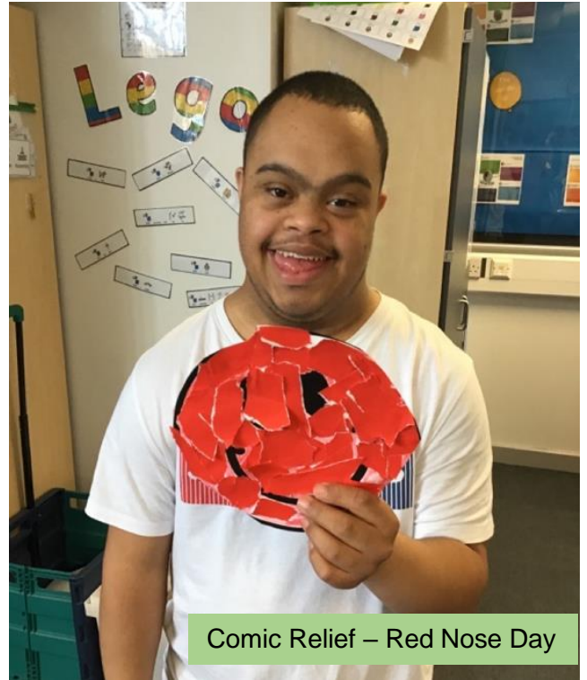
Comic Relief – Red Nose Day