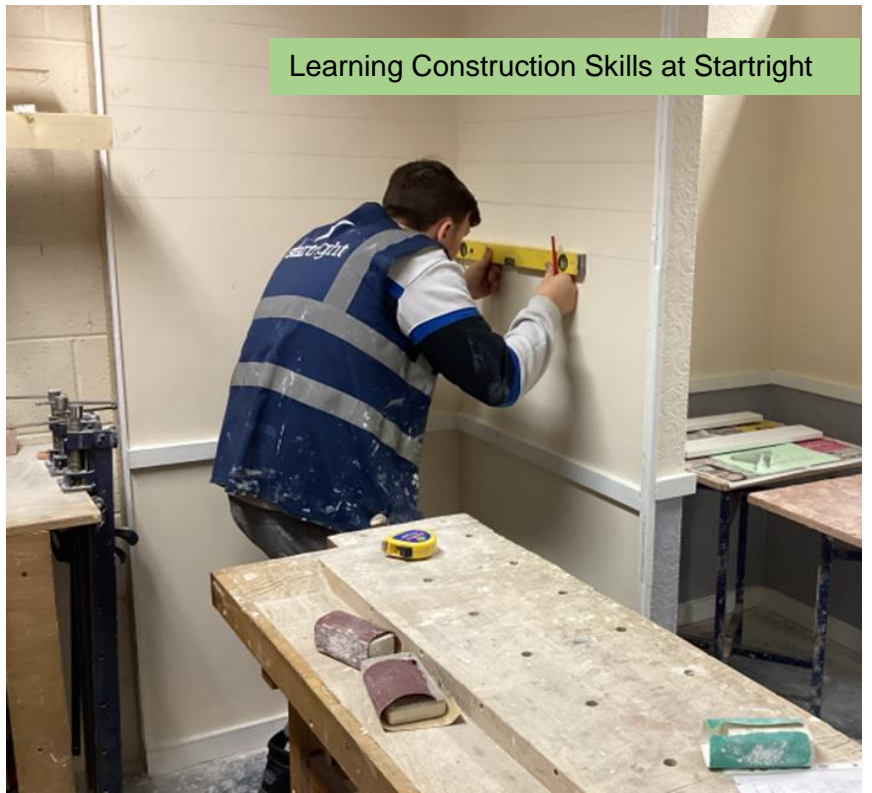
Learning Construction Skills at Startright