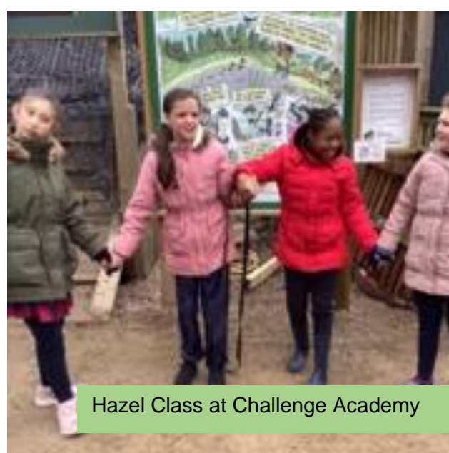
Hazel Class at Challenge Academy