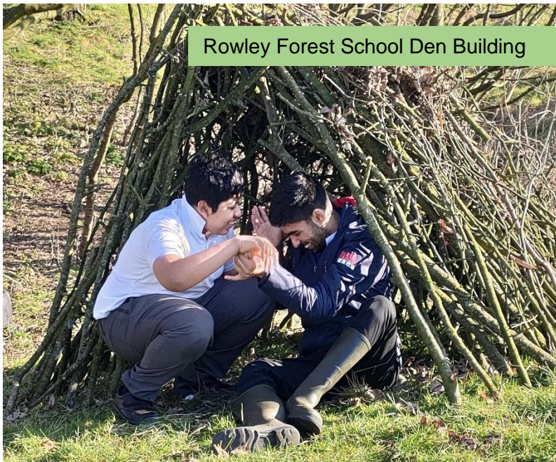
Rowley Forest School Den Building