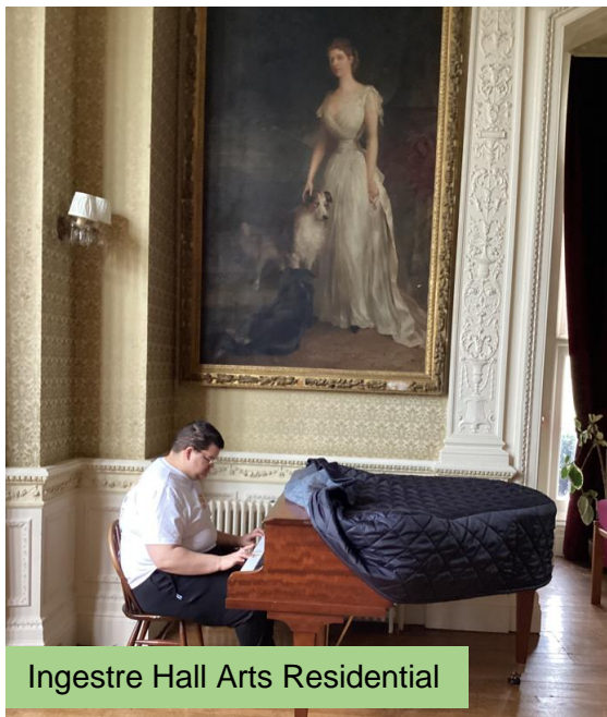
Ingestre Hall Arts Residential

There has been so much going on this term – here's what we've been up to.