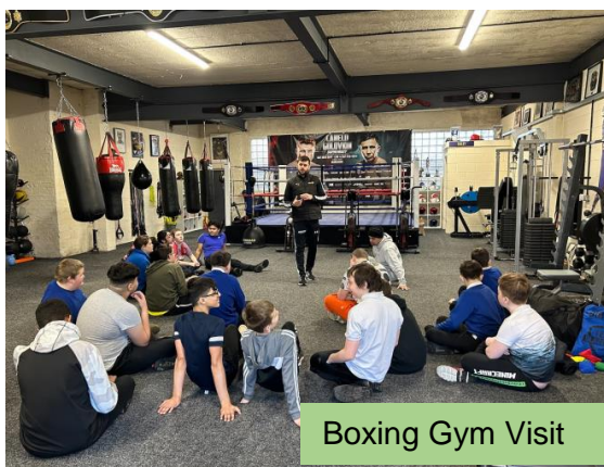
Boxing Gym Visit