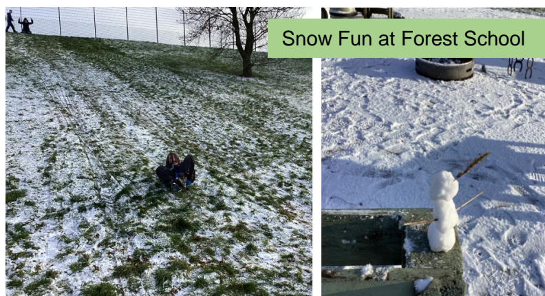
Snow Fun at Forest School