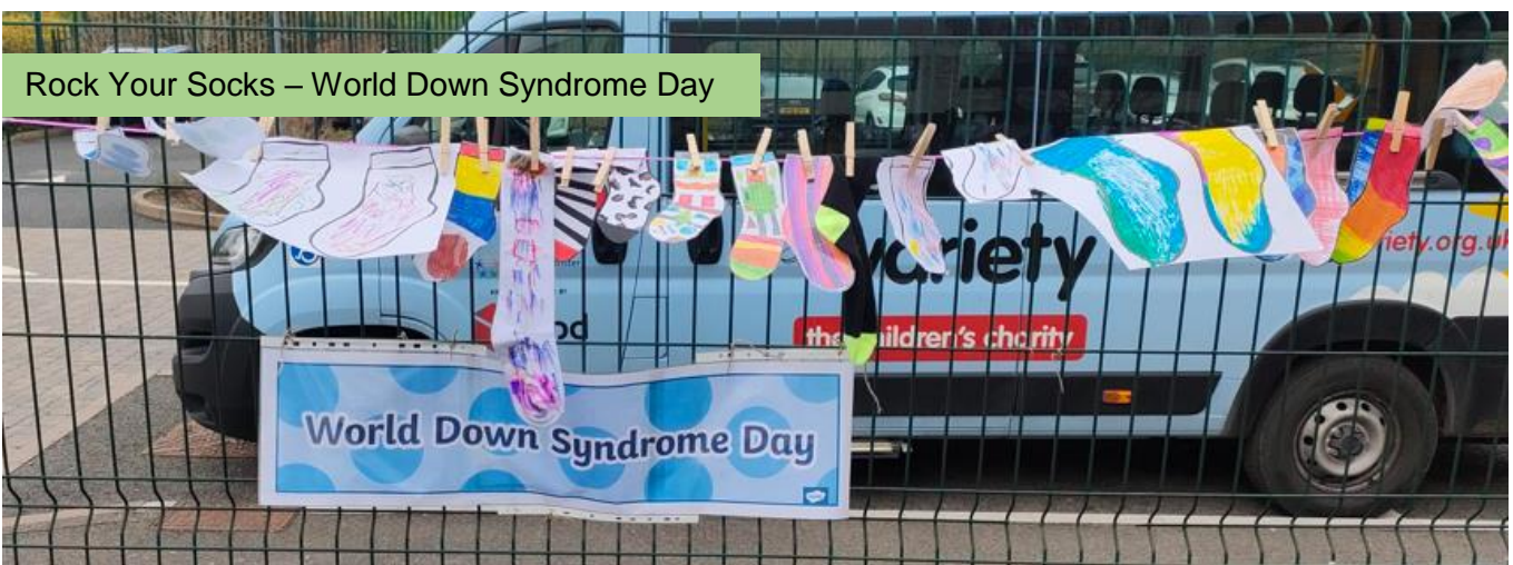
Rock Your Socks – World Down Syndrome Day