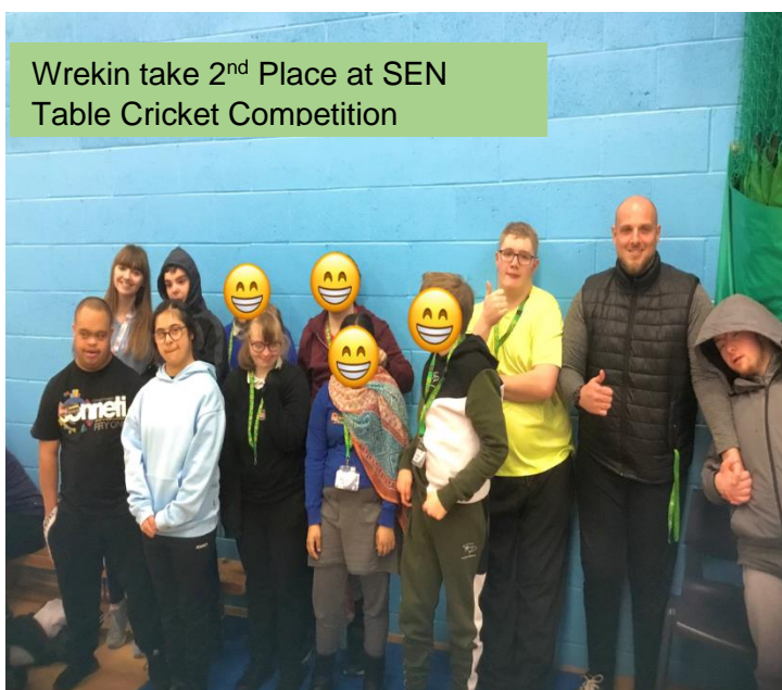
Wrekin take 2 nd Place at SEN Table Cricket Competition